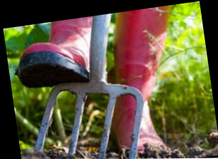
Green Week page 12-13