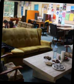
4x7 page 14