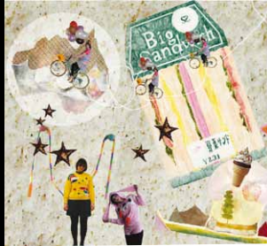
The world of (super cute) blogs page 6-7