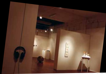
Why we love feminism page 4-5