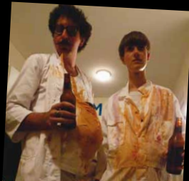
Teddy Bear's Picnic page 14