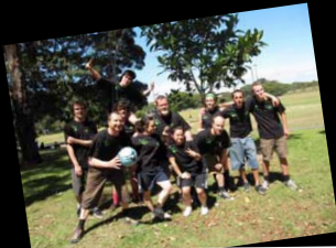
FA Cup page 12-13