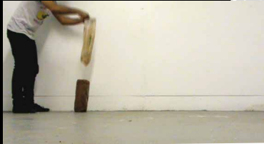
Dara Gill page 6-7