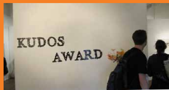
Kudos Award page 4-5