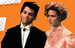
COFA Annual Parties back cover