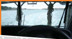
Arc @ COFA van goes overseas page 11