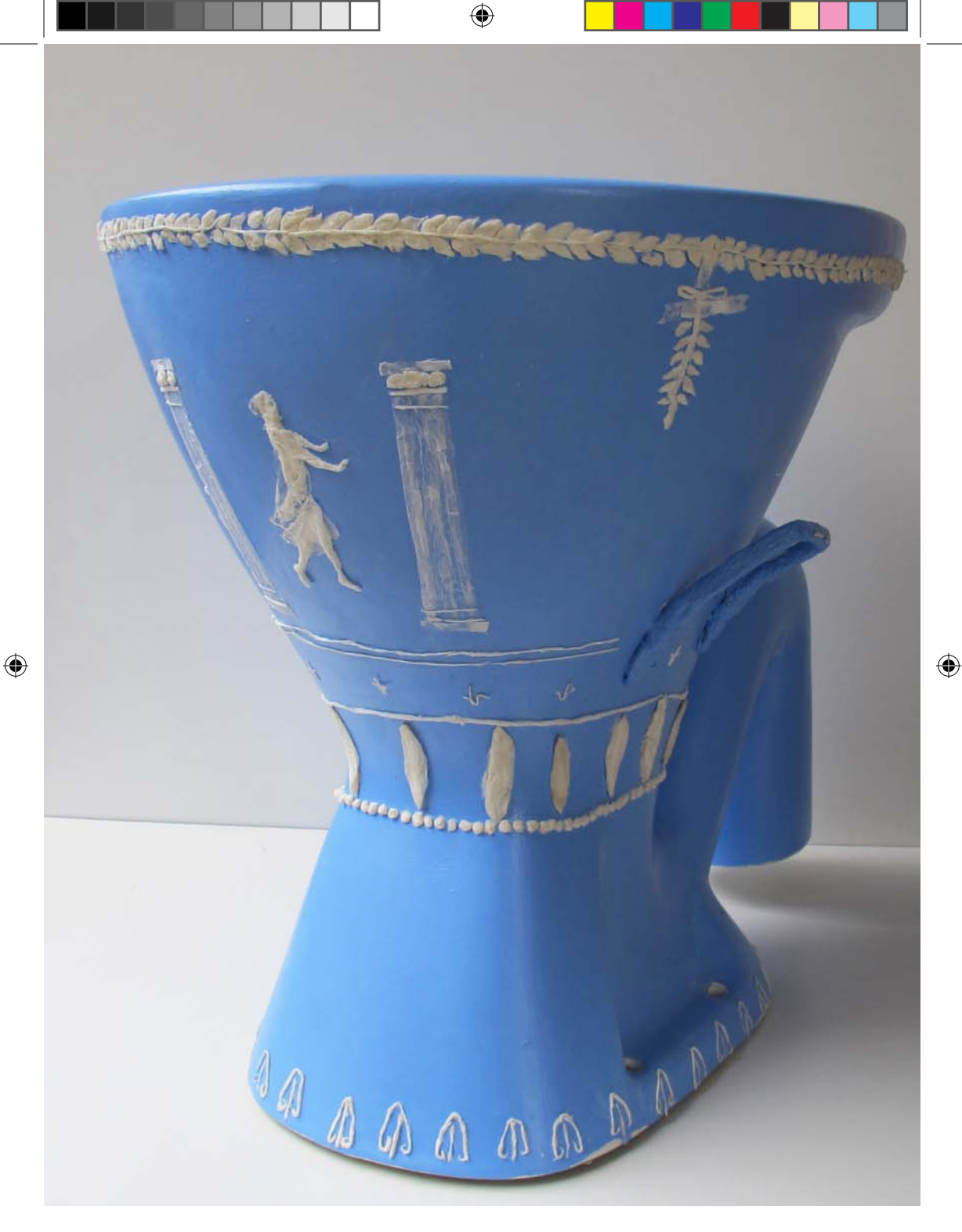
IMAGE: David Capra, Wedgewood Toilet, 2010. Paint and toilet paper on porcelain, 33 x 32 x 41cm