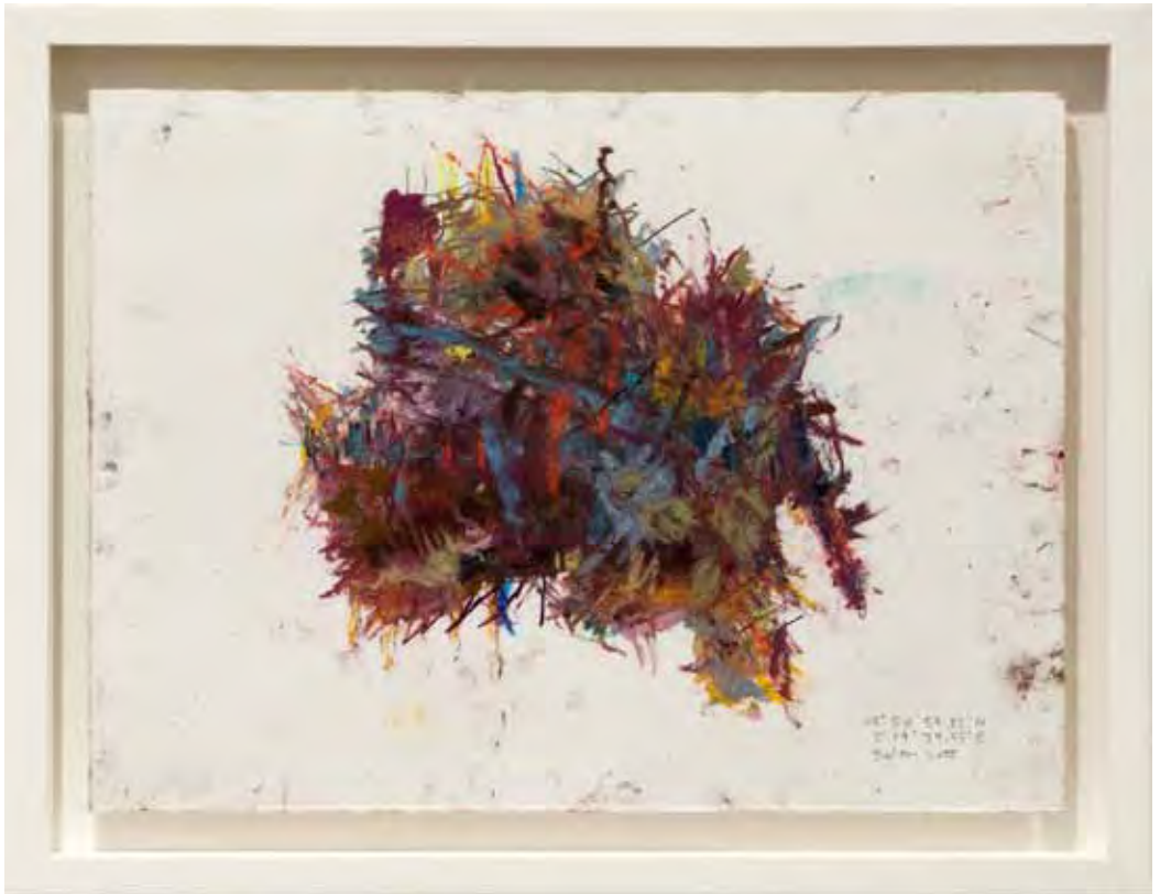
Images: Opp pg: Belem Lett, Sound drawings (1-10) , mixed media on paper 2012. This pg: Sound drawing 1 (48f 52' 25.15" N, 2f 18' 51.57" E), mixed media on paper, 34.5 x 44 cm 2012.

w w w . b e l e m l e t t . b l o g s p o t . c o m . a u /