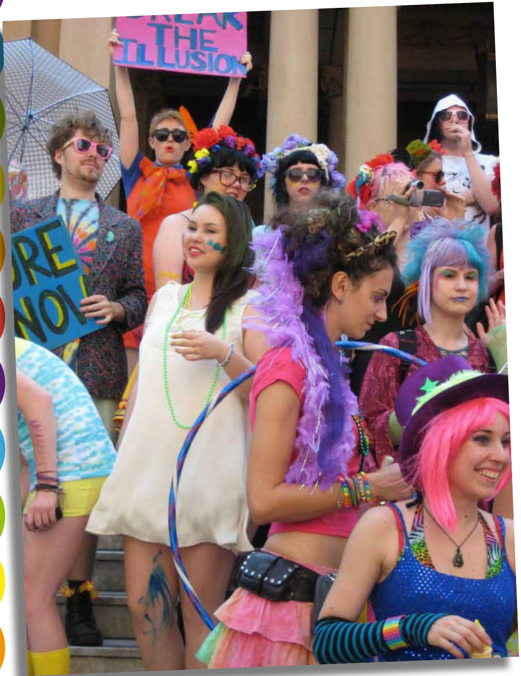
Images: ColourParade, Sydney 2011 Image credit: Josh Feeny and Atlas Mapps