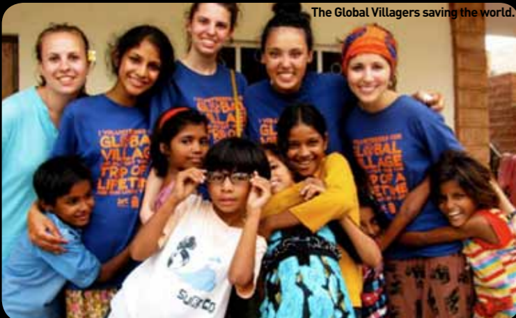
The Global Villagers saving the world.