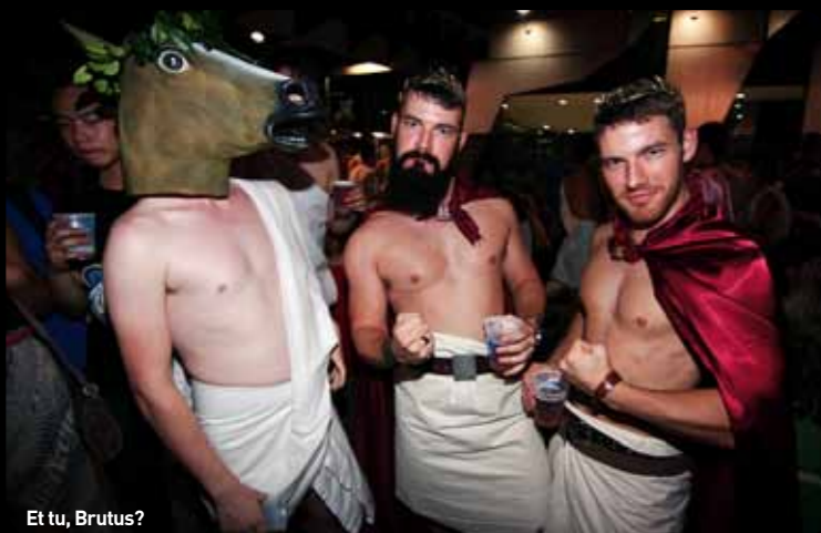
Et tu, Brutus?