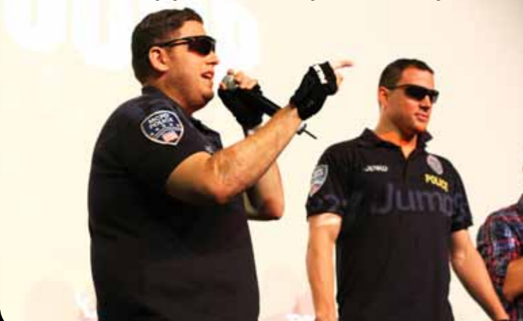
There was a mass teenage girl mob when Channing Tatum visited during O-Week.