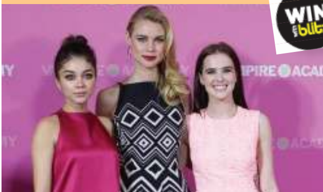
Left to Right: Vampire Academy stars Sarah Hyland, Lucy Fry and Zoey Deutch at the Sydney premiere.

To celebrate the release of Vampire Academy on 6 March 2014, Blitz has 5 prize packs (each worth $120) to give away! To get your hands on this awesomeness, follow us on Instagram @blitzunsw and post a pic of your fav vampire with the hashtag #blitzunsw.