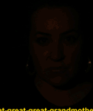
My great-great-great-grandmother is Wiradjuri