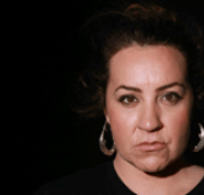
I am Wiradjuri

March is a big month for me with 3 exhibition launches starting with Notes to a Future Feminist Archive at Affiliated Text launching on the 3rd, Mass Group Incident: Tell Me My Truth at 4A Centre for Contemporary Asian Art launching on the 26th and (in) visible: the First Peoples and war at Lake Macquarie City Art Gallery, Booragul launching on the 29th. I'm also really excited to be working with Campbelltown Arts Centre (CAC) on SWARM their live art program for 2015/2016 which commences in March with a month long residency.