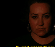
My great-grandmother is Wiradjuri