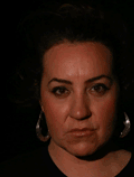
My grandmother is Wiradjuri