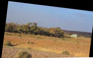
Going Out There page 4-7