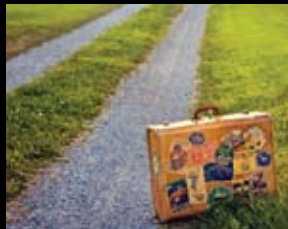
Kudos exhibition program page 15