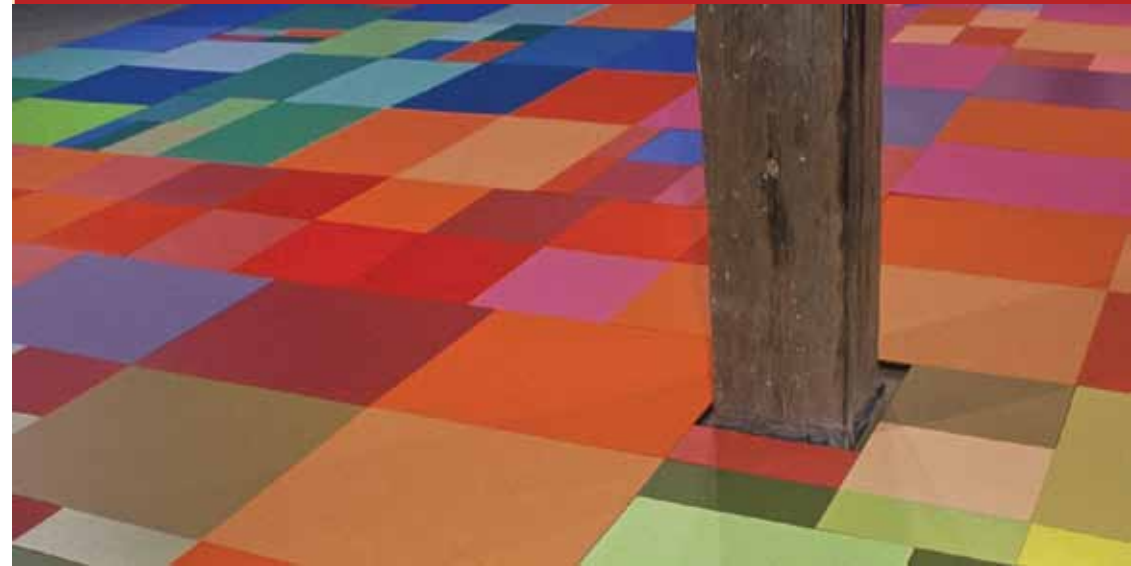
Beata Geyer, 'Polychromatic', acrylic on MDF, 2006. Installation at Artspace, Sydney.

2010 Kudos Gallery Management Committee applications close contact kudos@arc.unsw.edu.au