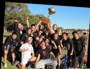
COFA wins 2010 Fine Arts Soccer Cup page 3-4