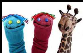
GROUP WORK: New COFA Society page 10