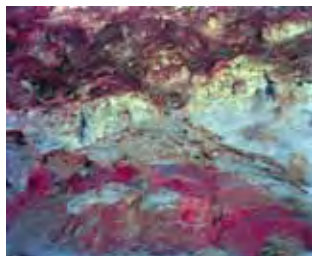
IMAGES: Marlaina Read "Untitled" 2010, Chromogenic print from negative "Untitled" 2010, Chromogenic print from negative opp pg Shannon Field "John Hill" 2010

metaphorical and physical stillness. Embedded in this stillness is endless possibility, the flow of the landscape as opposed to the kind of unquiet posited by the stresses of waking life.