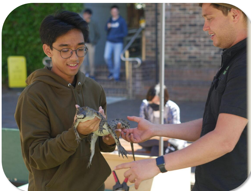
Figure 3 - CapySoc Member at O-Week meeting an extremely rare scale-backed capybara.

Thank you for considering our application!