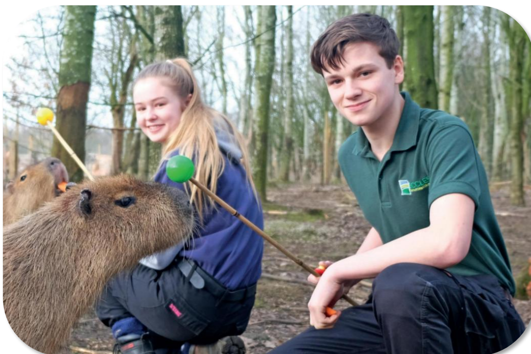
Figure 1 - CappySoc members on our recent field event.

(A big part of the funding allocation is to make Arc and yourselves stand out and look good – if you're up for an Award or your event will strengthen industry ties or you're a leader in your field – you should tell us about all of these!)